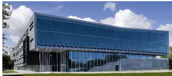
Fig. 1: An example figure showing the Alice Perry Engineering Building

Figures (and Tables) should use the format shown in the following example: